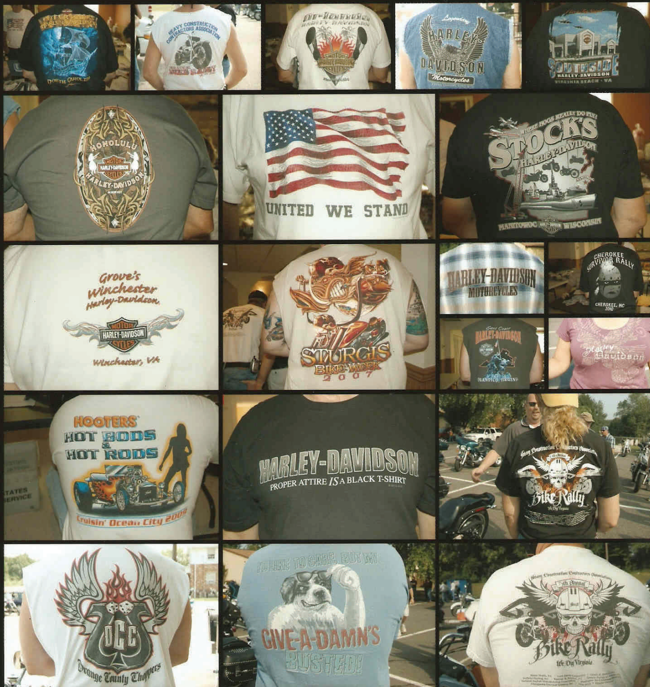
Photography and Layout by Linda Eszenyi