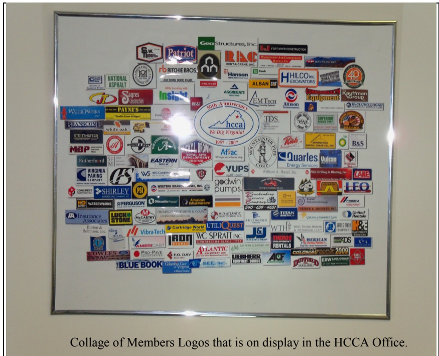
Collage of Members Logos that is on display in the HCCA Office.

July 17 (Rain Date) 6th Annual HCCA Motorcycle Rally